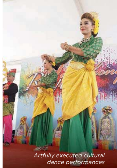
Artfully executed cultural dance performances