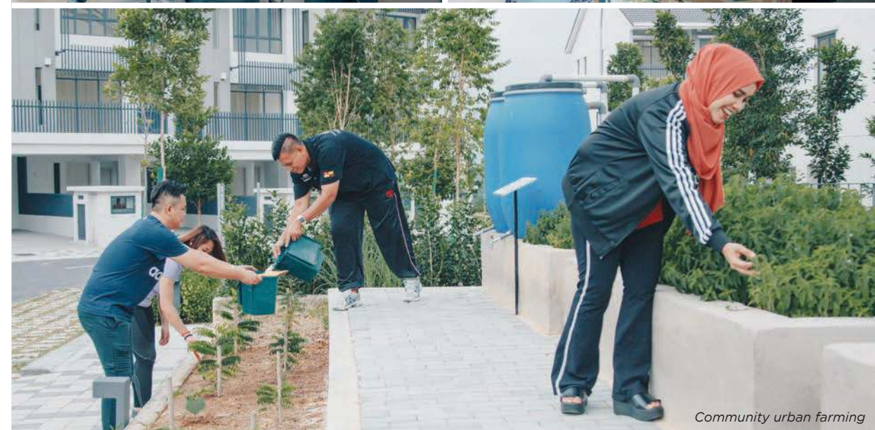
Community urban farming