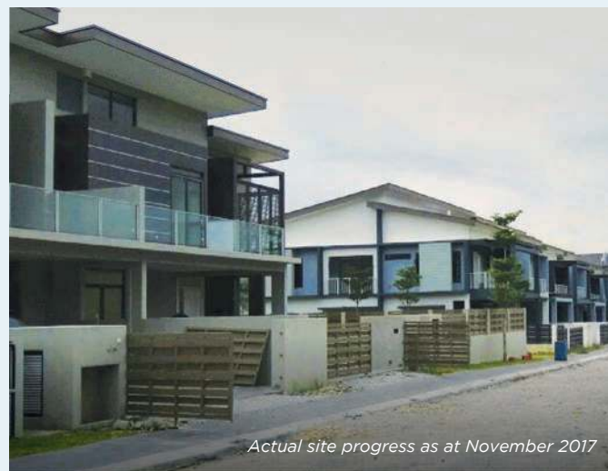
Actual site progress as at November 2017

the Vantage PREMIUM VILLAS SIGNATURE SERIES 4