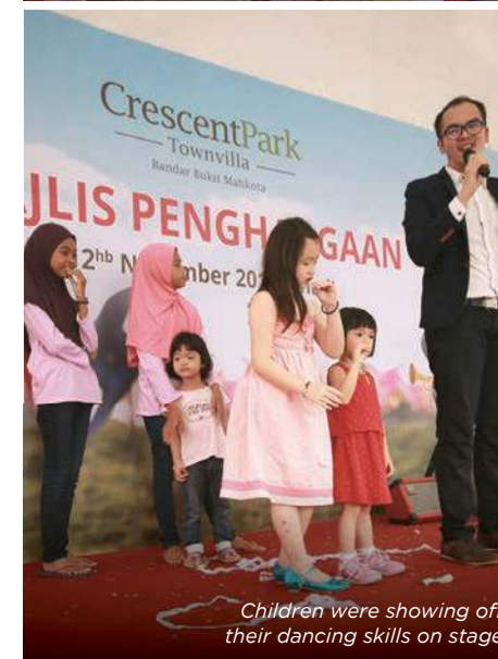
Children were showing off their dancing skills on stage