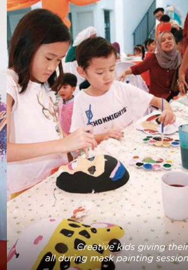
Creative kids giving their all during mask painting session