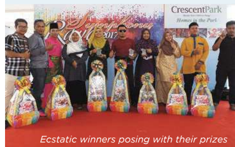
Ecstatic winners posing with their prizes