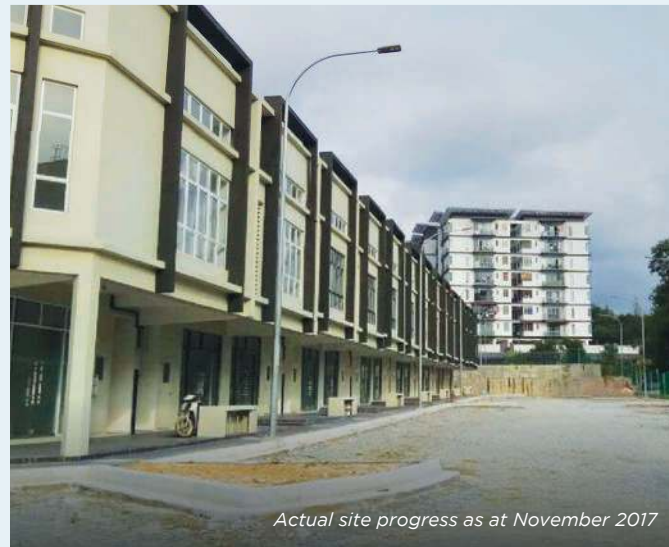
Actual site progress as at November 2017

M-Row boasts only 14 units that have been meticulously planned with contemporary concept design. It cleverly incorporates features that are practical and effective. The factory space can adapt to multiple functions such as a showroom, office, production floor and storage. This project creates opportunities for business owners to expand their businesses and property portfolio within this well populated community.