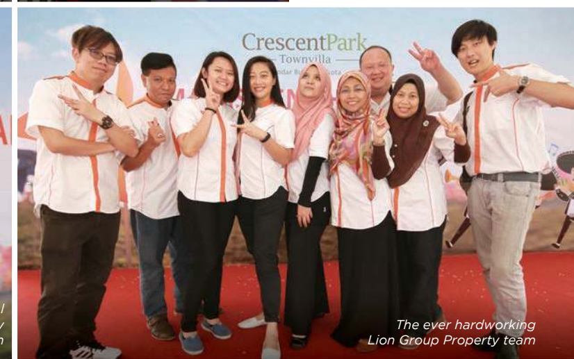
The ever hardworking Lion Group Property team