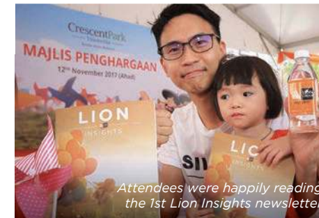
Attendees were happily reading the 1st Lion Insights newsletter

Besides the contest, there were many more Hari Raya inspired activities that went on throughout the day. A buffet spread filled with Malaysian delicacies kept the crowd happy while parents and children alike got to try their hand at batik painting and were able to keep their artistic creations as souvenirs.