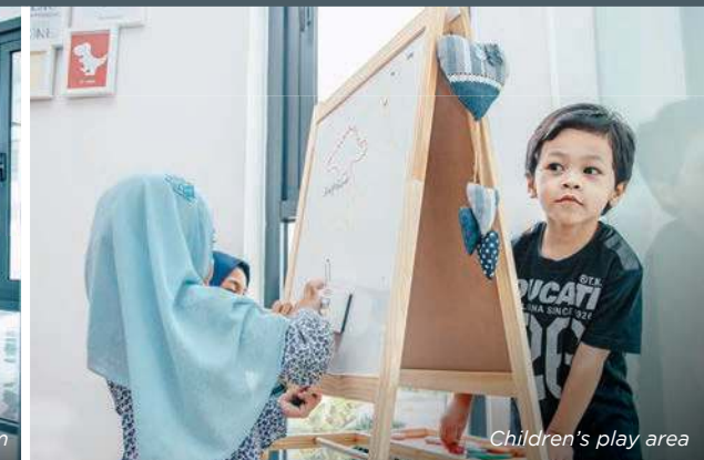
Children's play area