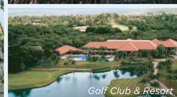
Golf Club & Resort