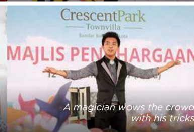
A magician wows the crowd with his tricks