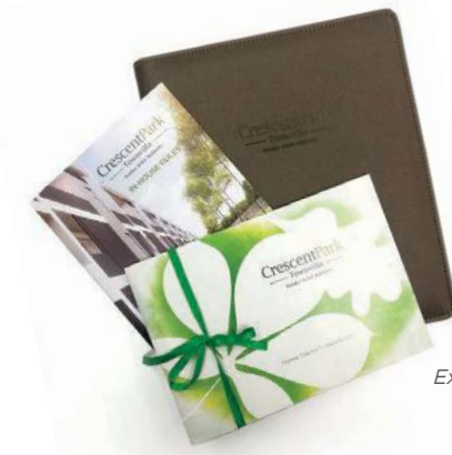
Exclusive handover kits for owners