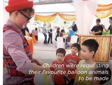
Children were requesting their favourite balloon animals to be made