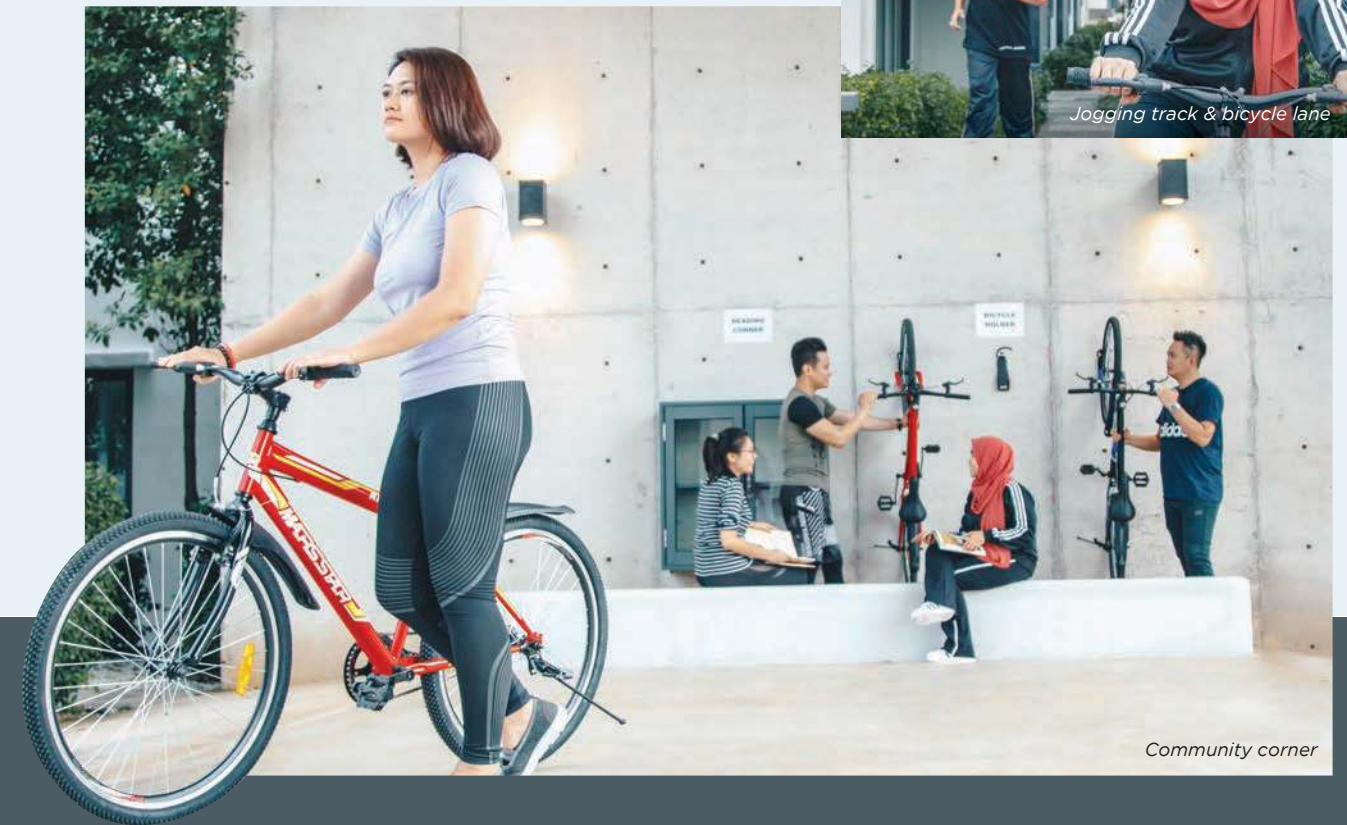
Jogging track & bicycle lane

Limited choice units are still available, contact the Sales & Marketing Department at 013-248 6412 / 017-884 1490 to inquire or visit our show unit now!