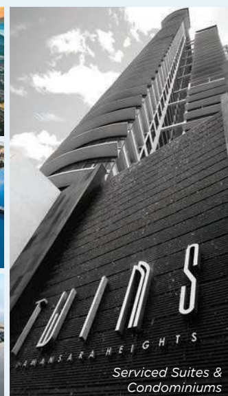
Serviced Suites & Condominiums