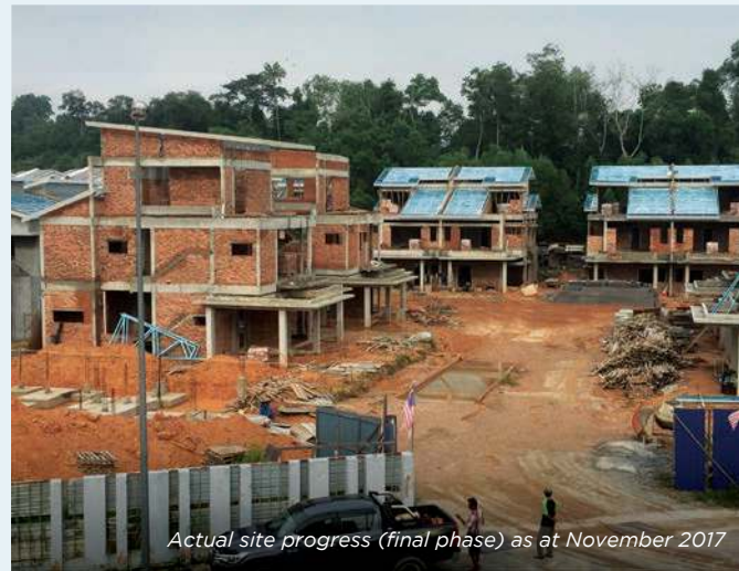
Actual site progress (final phase) as at November 2017

The Vantage is located within a well-established suburban residential area, it allows for quick connection to the city and surrounds, while still enjoying uninterrupted privacy in this guarded community.